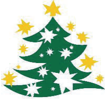
Charlie Brown Family Christmas Project